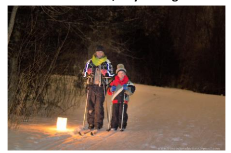
Venture to Baylor Regional Park for a wintery adventure. Glide through candlelit

trails on cross-country skis, take a tractor-drawn hayride through the park, warm up by the bonfire with cider and smores then